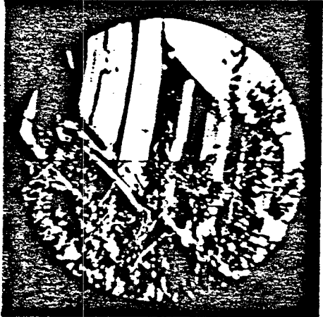
PHOTOGRAPH THROUGH RIFLE SCOPE