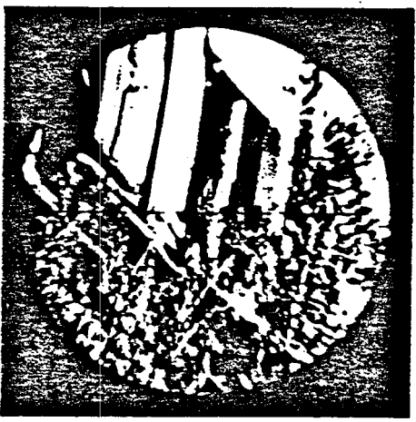
PHOTOGRAPH THROUGH RIFLE SCOPE