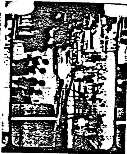
PHOTOGRAPH FROM ZARFUDER FILM