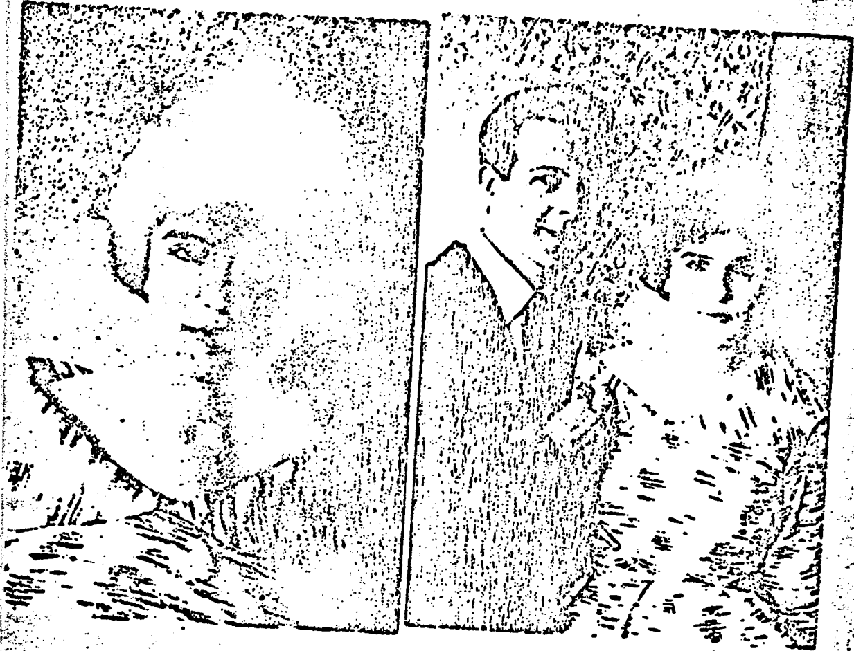
Mairina & Lee Harvey Oswald on their wedding day, April 30, 1961