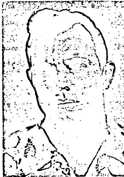
Officer J. D. Tippitt

It seems that preparations had been made for rioting and murder throughout the country. Americans known to be opponents of the Conspiracy, including General Walker, prominent members of the John Birch Society, and leaders of other conservative organizations, began to receive threats of death by telephone from creatures who somehow knew that Kennedy was dead before he reached the hospital. In many communities, mobs composed of the dregs of humanity and openly proposing to burn the homes and murder the families of known conservatives, began to form in the evening, as though in obedience to orders that had not been countermanded to all sectors. I do not suggest that the local vermin were entrusted with a fore-knowledge of precisely what was to happen in Dallas,