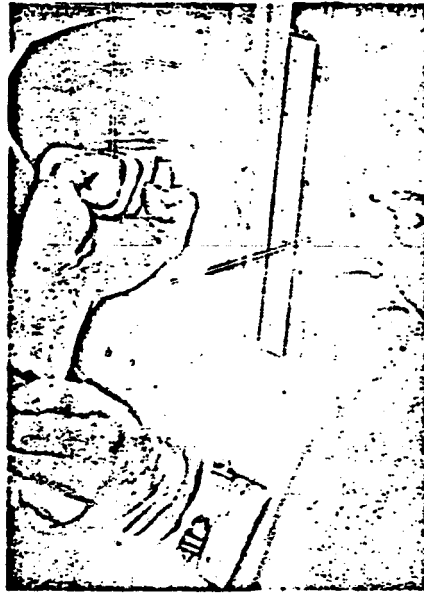
The Communist clenched-fist salute.

should themselves be on trial for their efforts to subvert and destroy the Constitution. Since no American cow is wealthy after having been milked by the Income-Tax collectors, and since the majority of conspicuously loyal Americans are persons of very modest means, just one item, the cost of employing attorneys, could give the gang the power to inhibit and even paralyze most of the opposition to treason in the crucial year of 1964. It is possible, of course, that the "commission" may simply assume such powers. If so, Congress will probably object; but, if it should be necessary, the august Chief Justice could dash over to the Supreme Court Building, put on his black robe, and rule that Congress, like God, is un-Constitutional. It's just a ten-minute trip by cab.