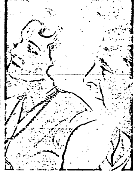
ames corresponding to those of kn

Another reason is that revelations about this conspiracy are fantastic to the Western mind. Many people stooped to laugh about serious findings of the Dies Committee. Unfortunately, the media of information in this country have too many times discredited grave and truthful revelations as a "publicity stunt." And this general disbelief, carefully and shrewdly encouraged by the Communists, has greatly facilitated their conquest of one-third of the world's population. But I have listened to the testimony of many credible former Communists, including the man who was in charge of their espionage for Western Europe (who himself died in a Washington hotel under mysterious circumstances) and I have helped uncover Communist crimes; and