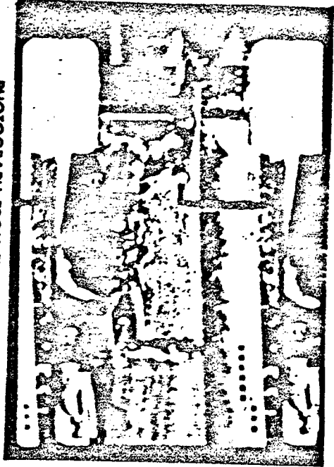
PHOTOGRAPH FROM ZAPRUDER FILM