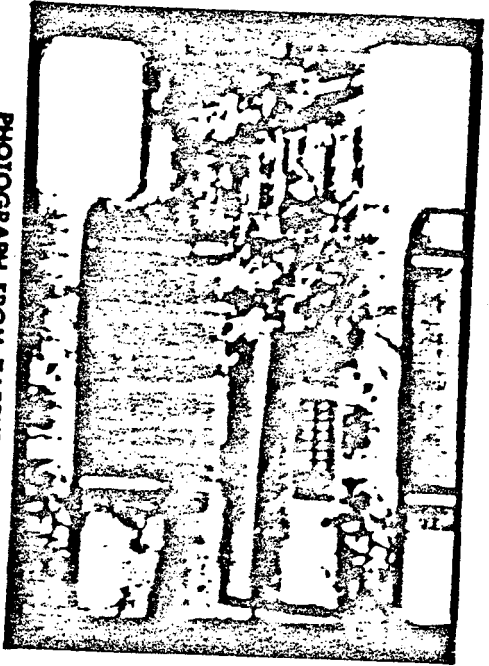
PHOTOGRAPH FROM ZAPRUDER FILM