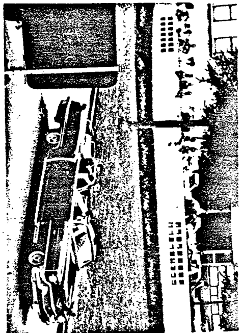
PHOTOGRAPH FROM RE-ENACTMENT