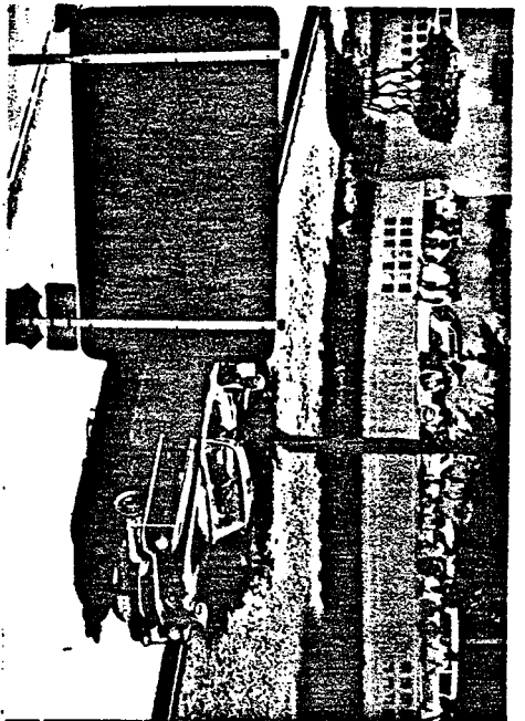
PHOTOGRAPH FROM RE-ENACTMENT