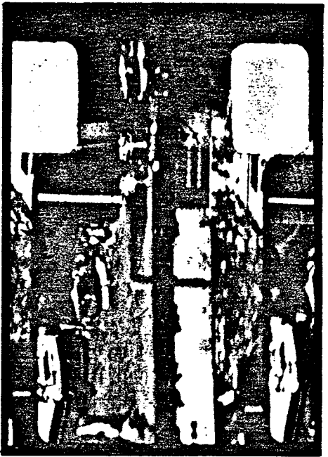
PHOTOGRAPH FROM ZAPRUDER FILM