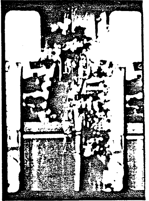
PHOTOGRAPH FROM ZAPRUDER FILM