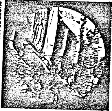
PHOTOGRAPH THROUGH RIFLE SCOPE