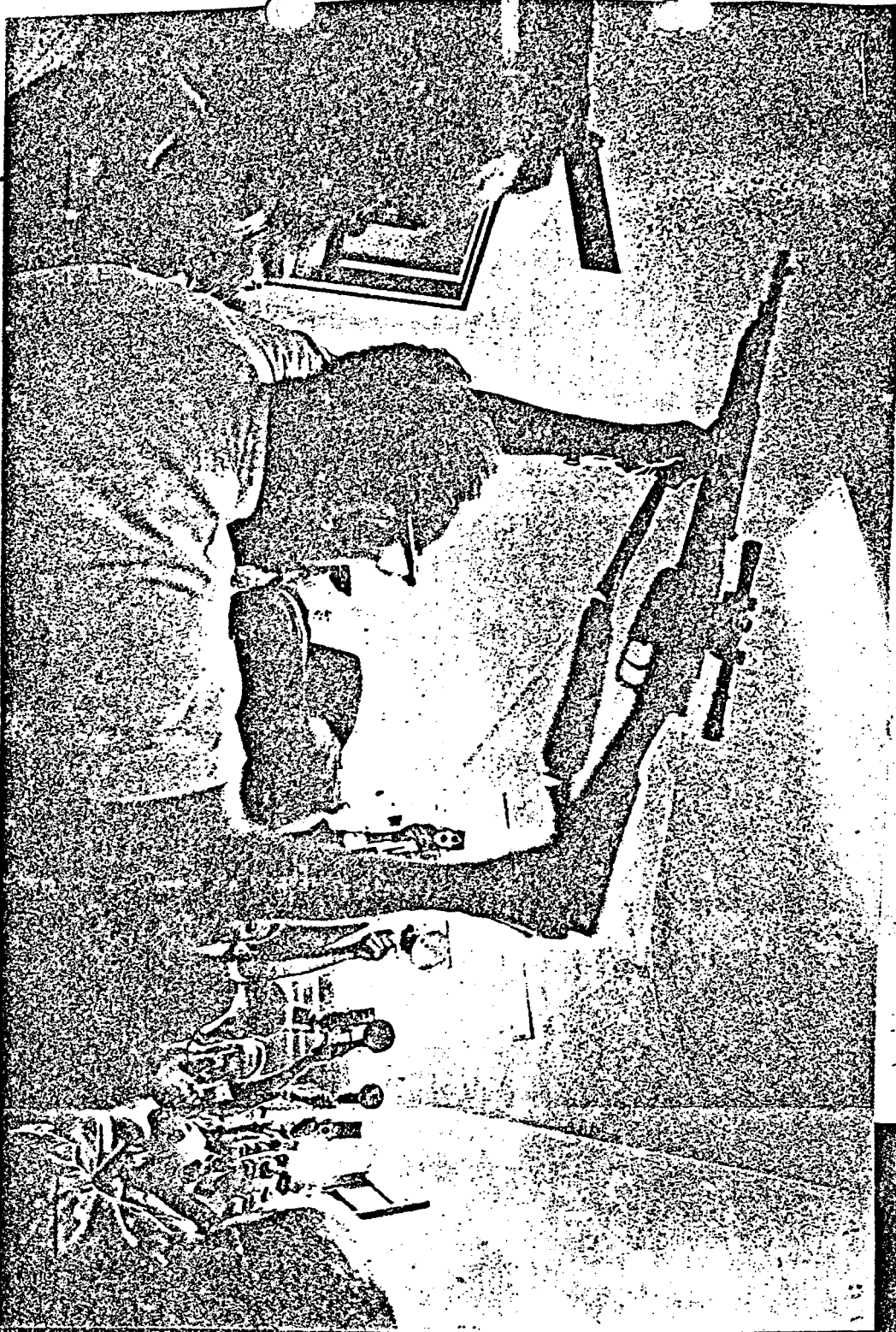
Dallas police officer holds aloft alleged murder weapon.