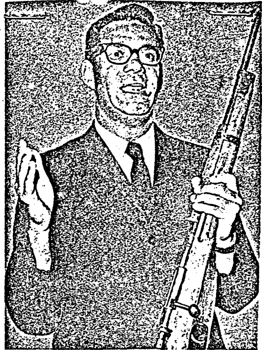
Mark Lane, top, and Lee Harvey Oswald.