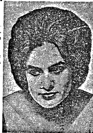
MRS. MARINA OSWALD