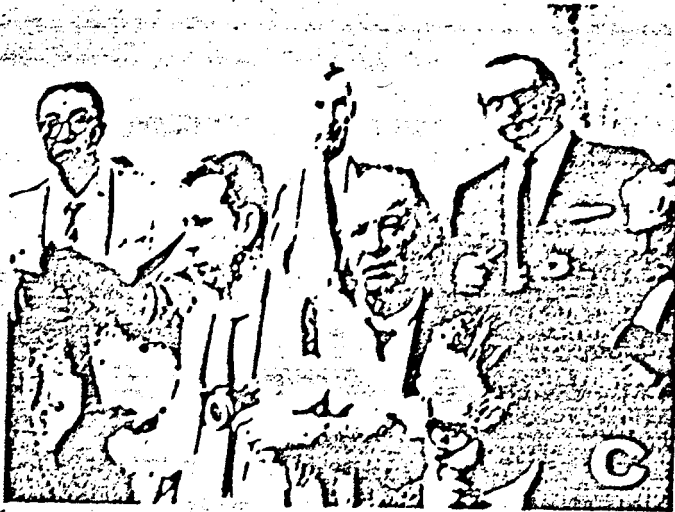
RUBY AT NIGHT CONFERENCE IN BASEMENT POLICE ASSEMBLY ROOM ABOUT MIDNIGHT