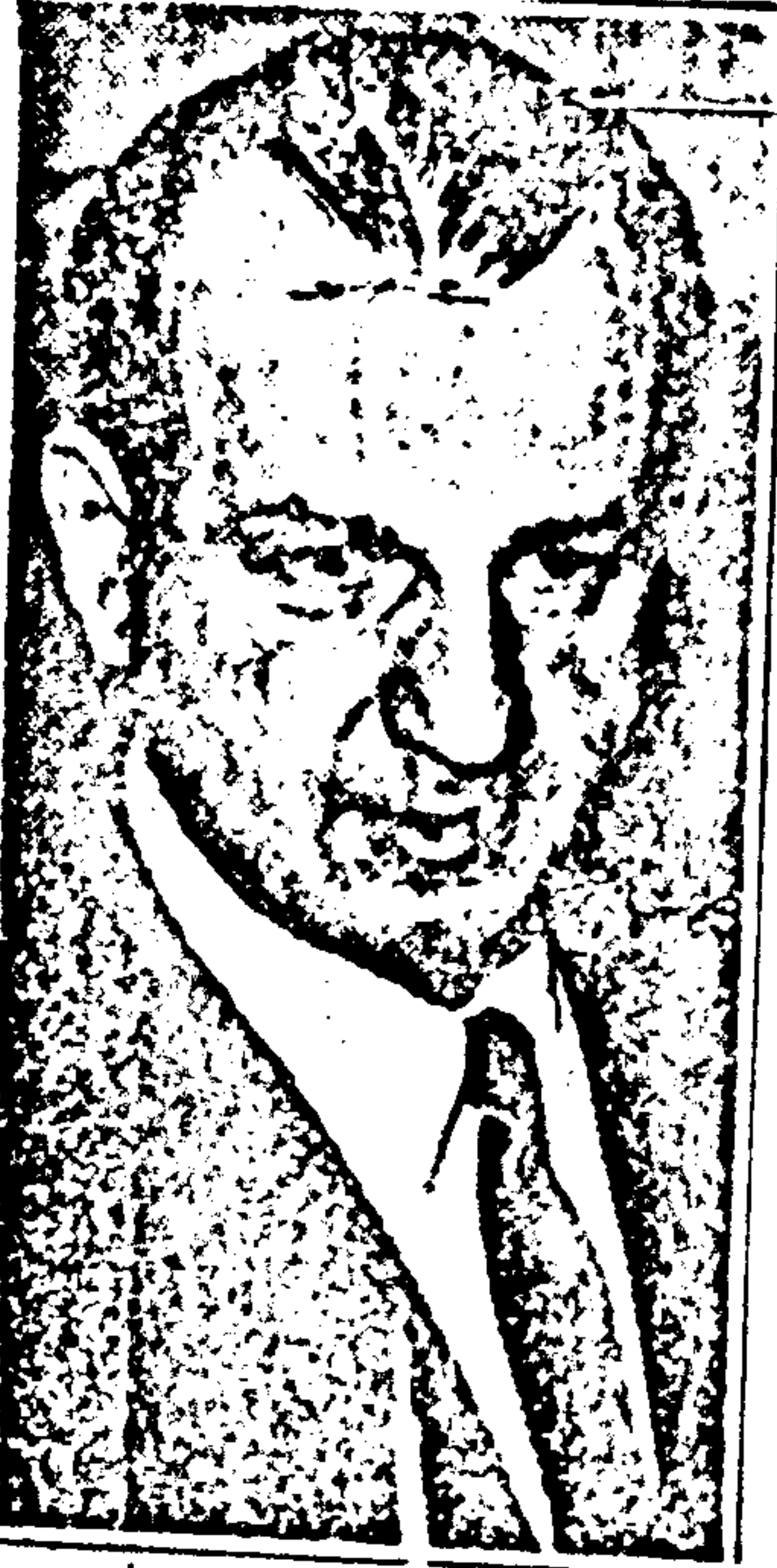
Jack Ruby Did he visit Castro?

Soon after President Kennedy was murdered, the FBI received information that Jack Ruby had made a secret trip to Cuba before the assassination. But the FBI apparently failed to verify this report or determine whether Ruby had been involved in a plot to kill the President.