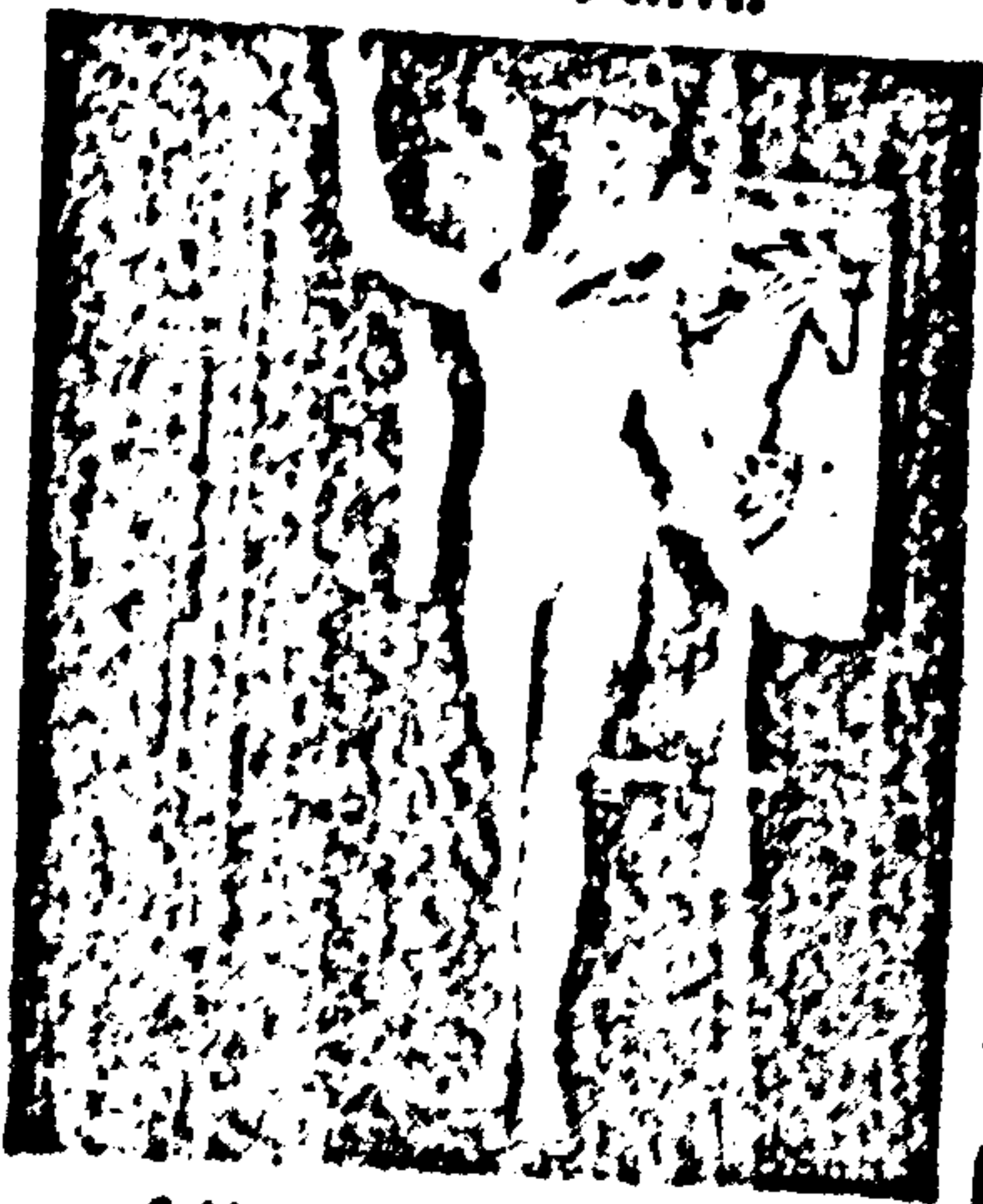
SHARI ANGEL Dolby Cue Gypsy - See her perform that song for rondo of songs from the popular movie "Gypsy" with one more gown - and exciting music.