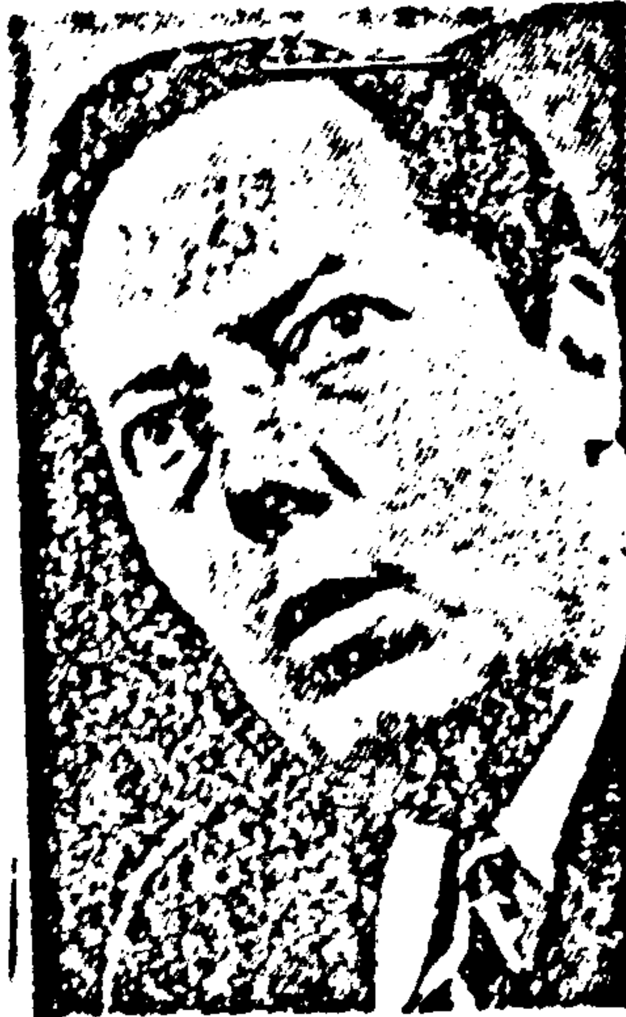
DISTRICT ATTORNEY JIM GARRISON

-Names and addresses of jurors selected can be re-used after they are selected.