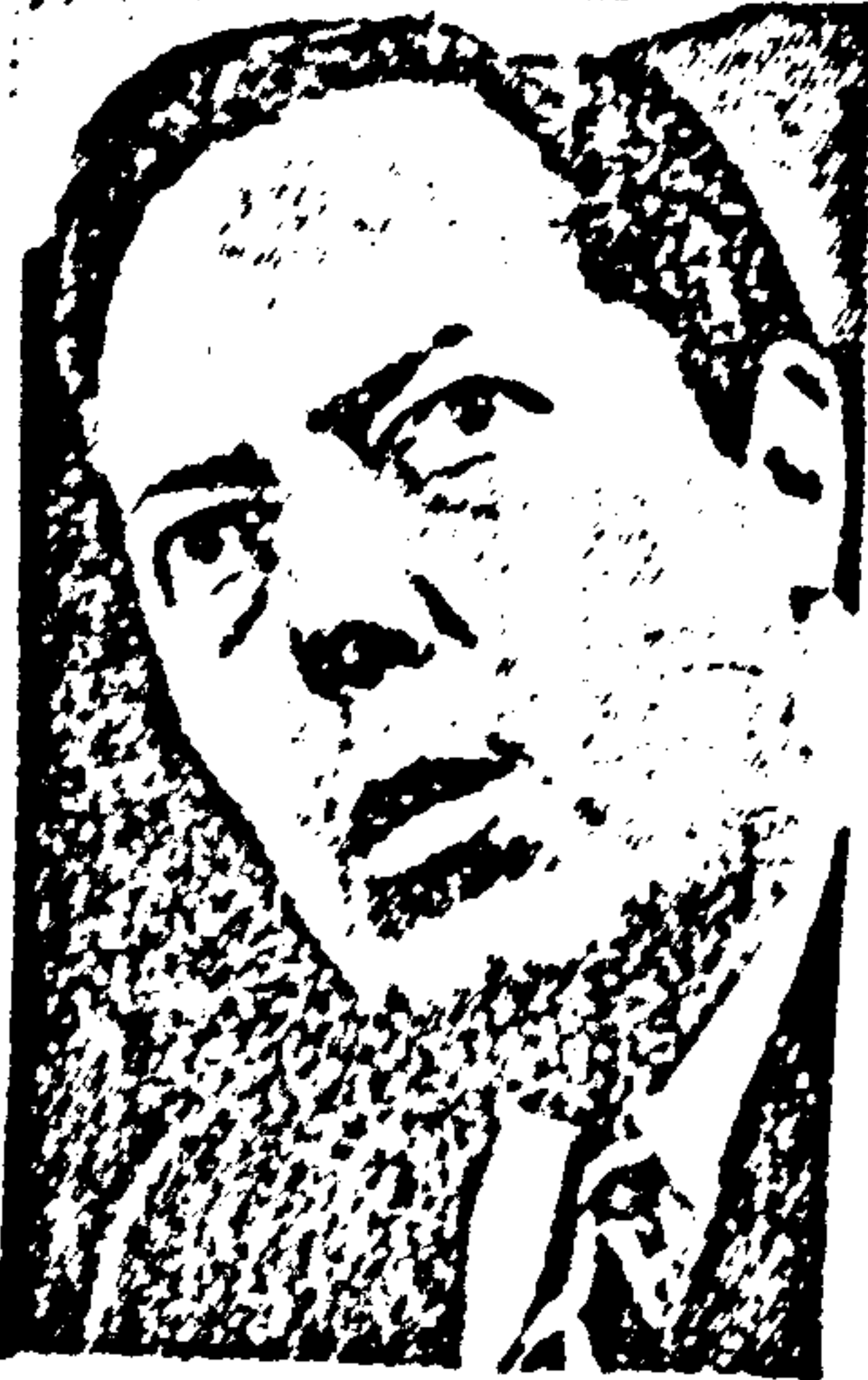
DISTRICT ATTORNEY JIM GARRISON