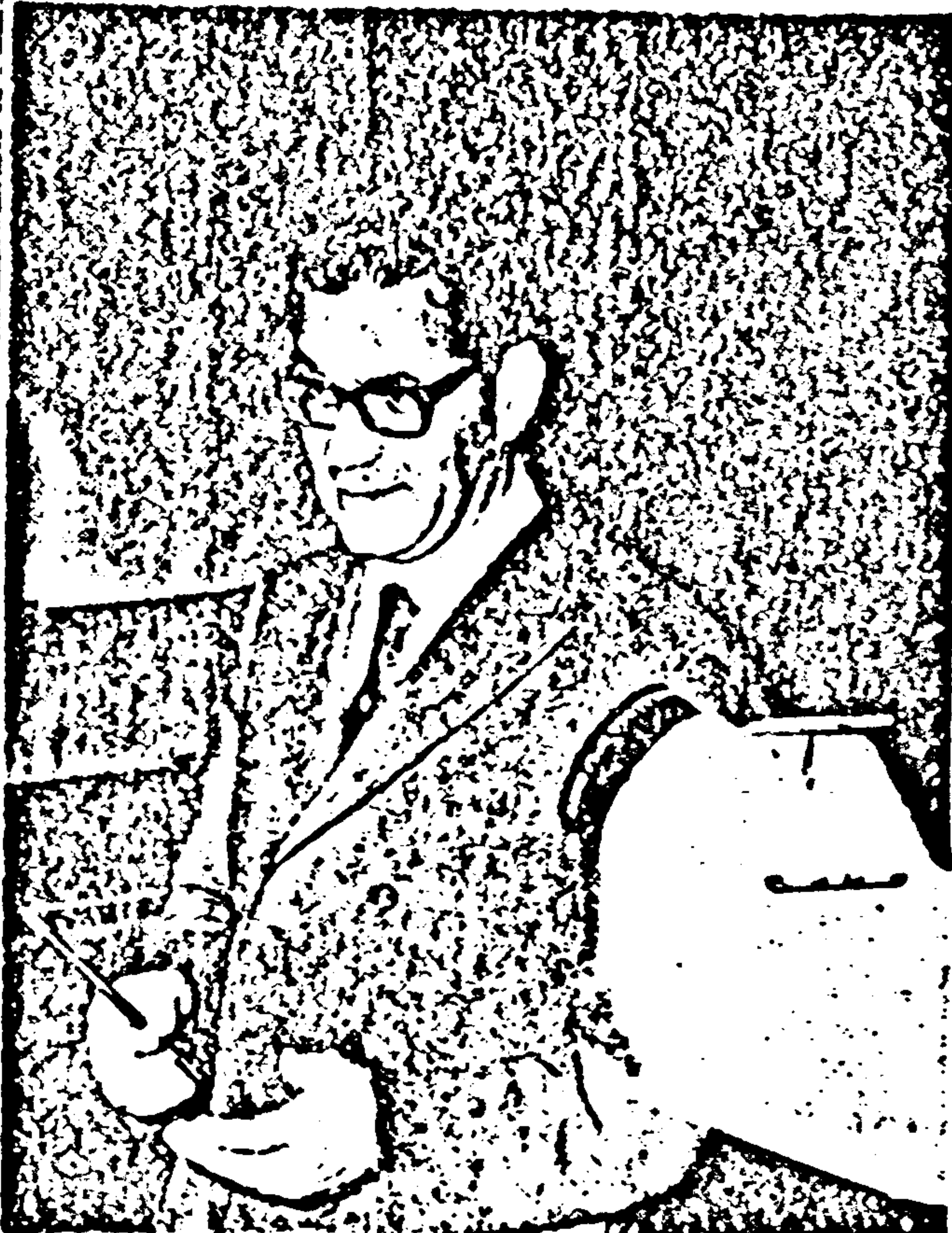
DISPUTES WARREN REPORT —The author of "Rush to Judgment," attorney Mark Lane, explained his disagreement with major points in the Warren report in a speech at the LSU Union Theater last night. Lane now works as an unpaid assistant to New Orleans Dist. Atty. Jim Garrison in his probe of the Kennedy assassination.

Lane told about his troubles in getting his book published after he decided the only thing he could do to get the story told was to tell it himself. He cited extreme pressures which he said were exerted to prevent both his investigations of the as-