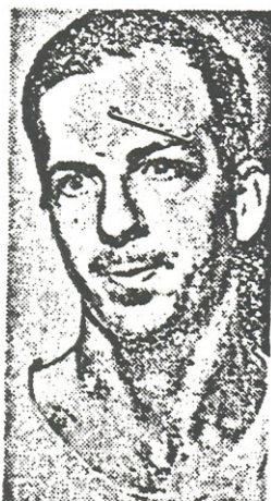
LEE HARVEY OSWALD Was active here