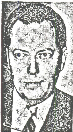
DA JIM GARRISON Checking plot.