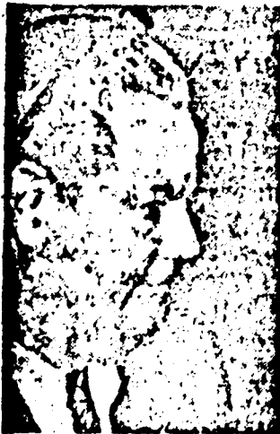
JOE TONNEHILL Ruby's Lawyer