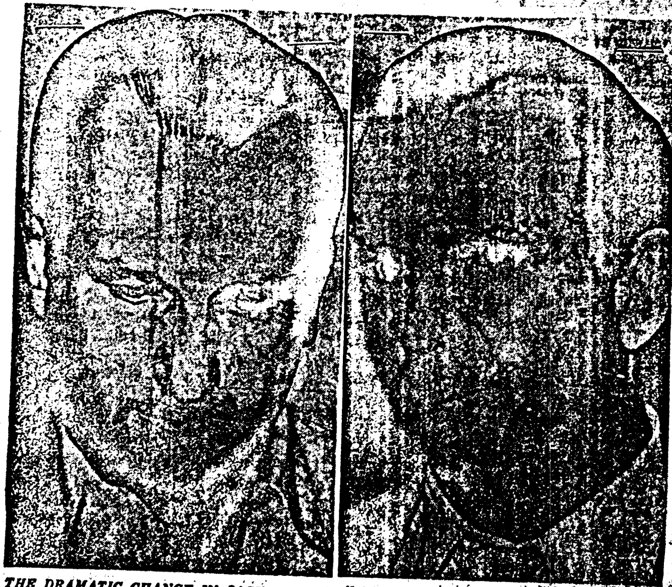
THE DRAMATIC CHANGE IN JACK RUBY: At the time of his arrest for killing Lee Oswald