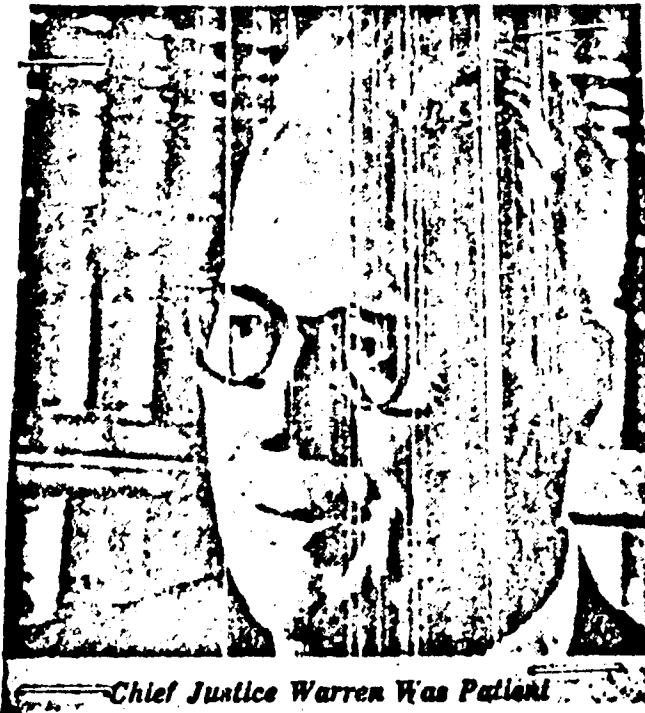
Chief Justice Warren Was Patient

RUBY: No . . . I never had the facilities or capabilities of knowing where to get jeeps."