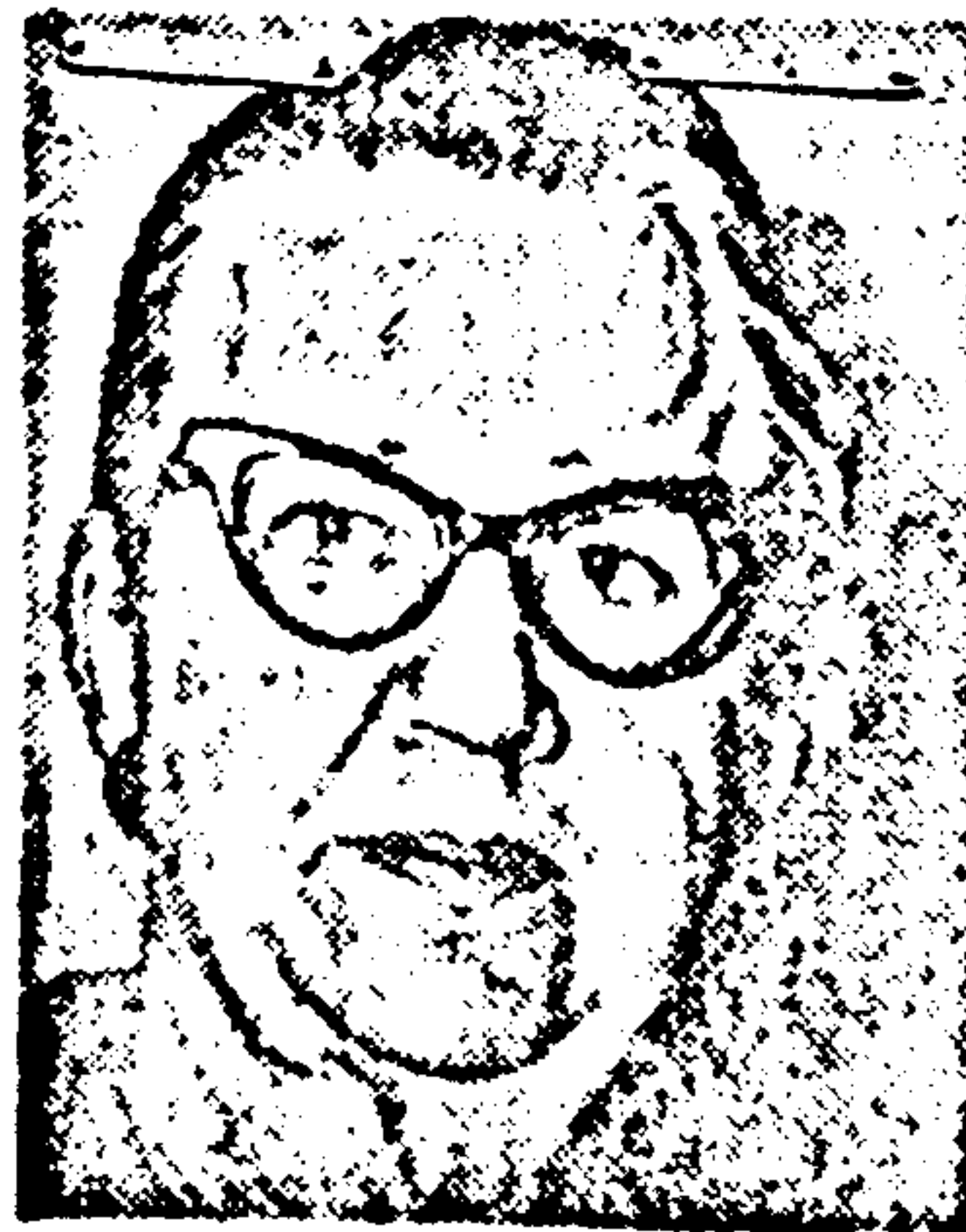
Mrs. Marguerite Oswald

The committee approved a bill authorizing the government to acquire and keep the rifle and other items connected with the assassination, saying the physical evidence should be kept to eliminate any questions and doubts about the assassination that may arise.