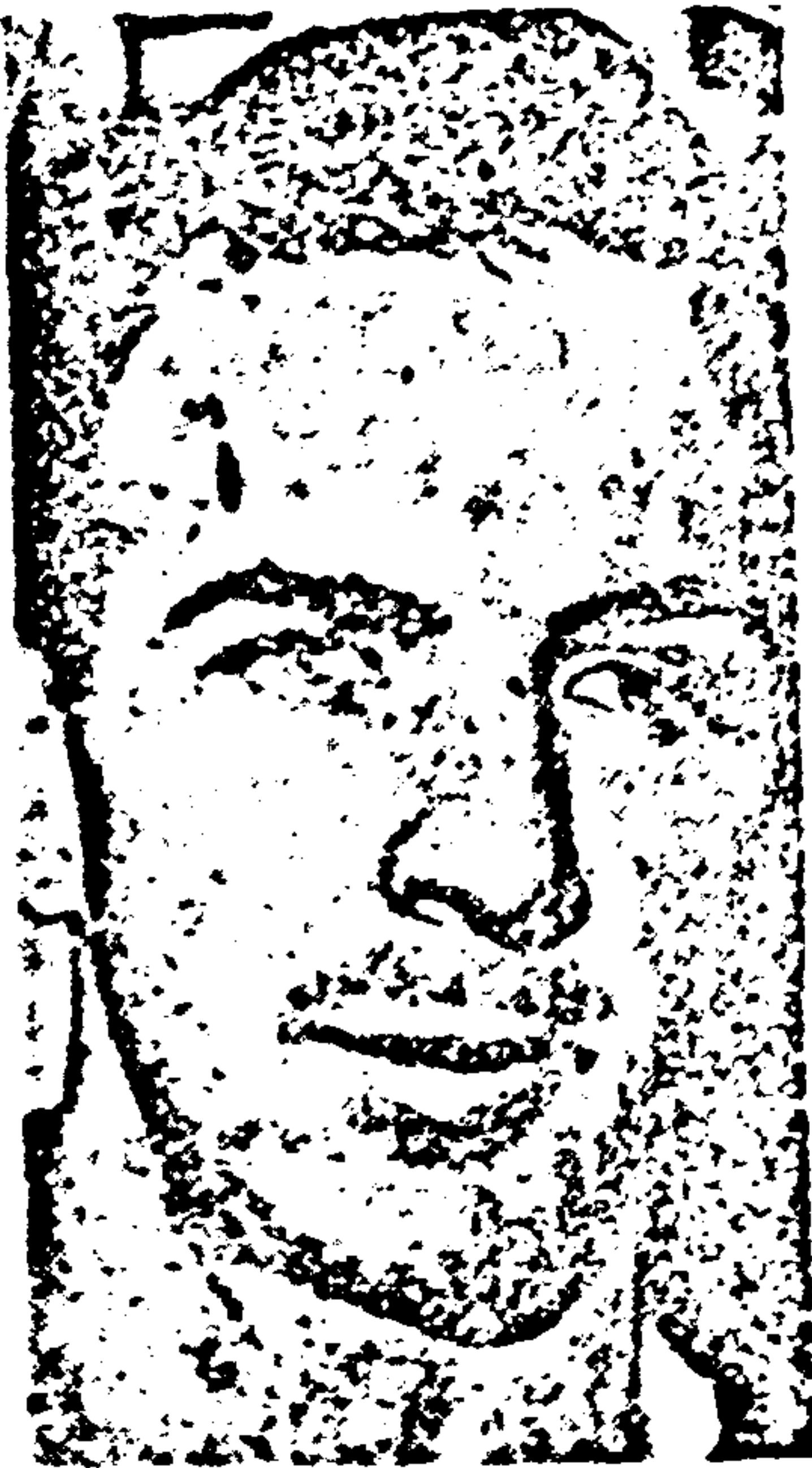
Lee Harvey Oswald God and Karl Marx

At the time of the signing, Oswald's mother and her third husband were fighting. They separated in January of that year and in March were divorced.