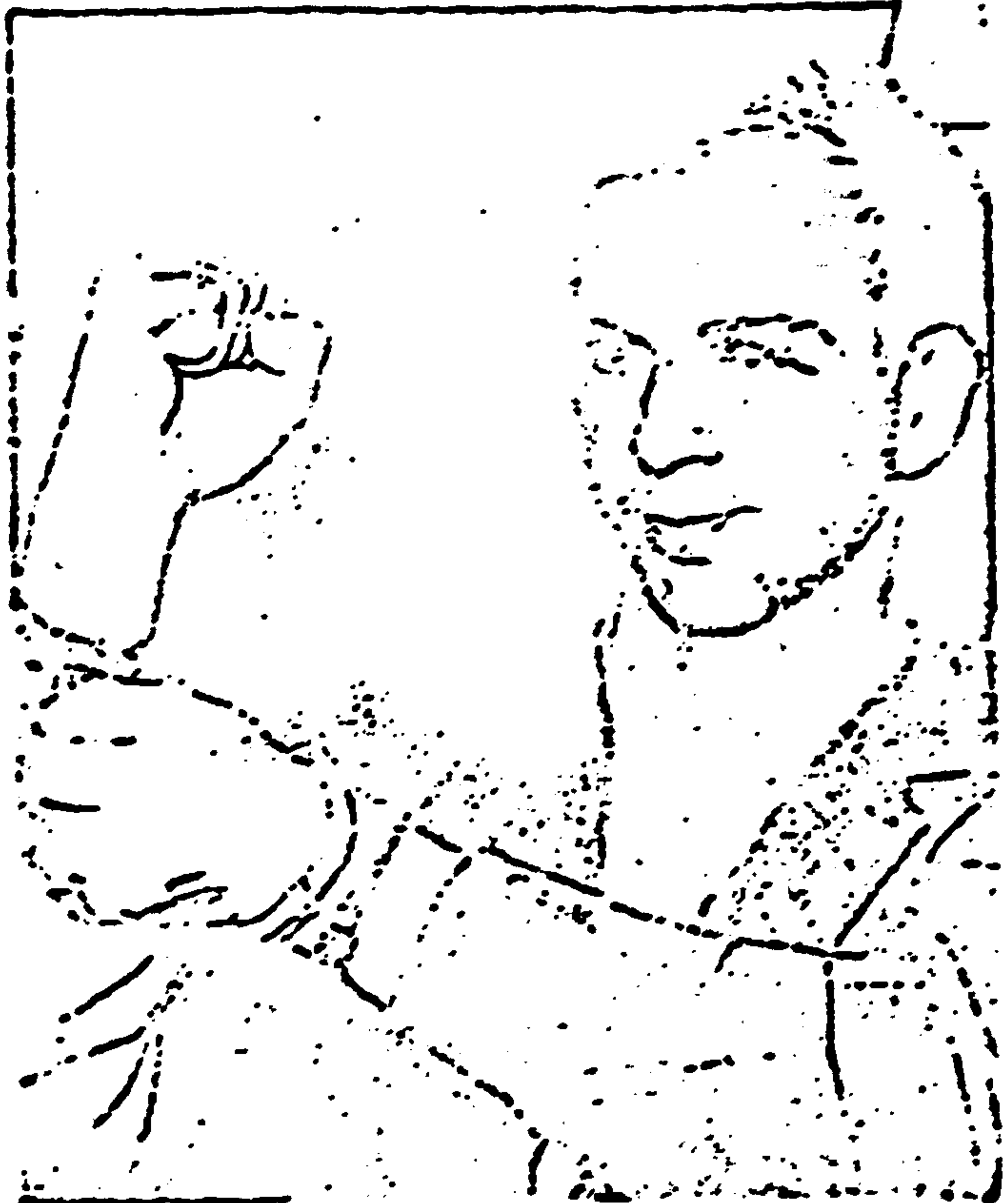
DEFIANT LEE HARVEY OSWALD . . . . . . Manacled Suspect Held In Dallas

Note Lee Oswald's upraised, clenched fist , the Communist symbol of the triumph of Marxism by revolutionary violence.