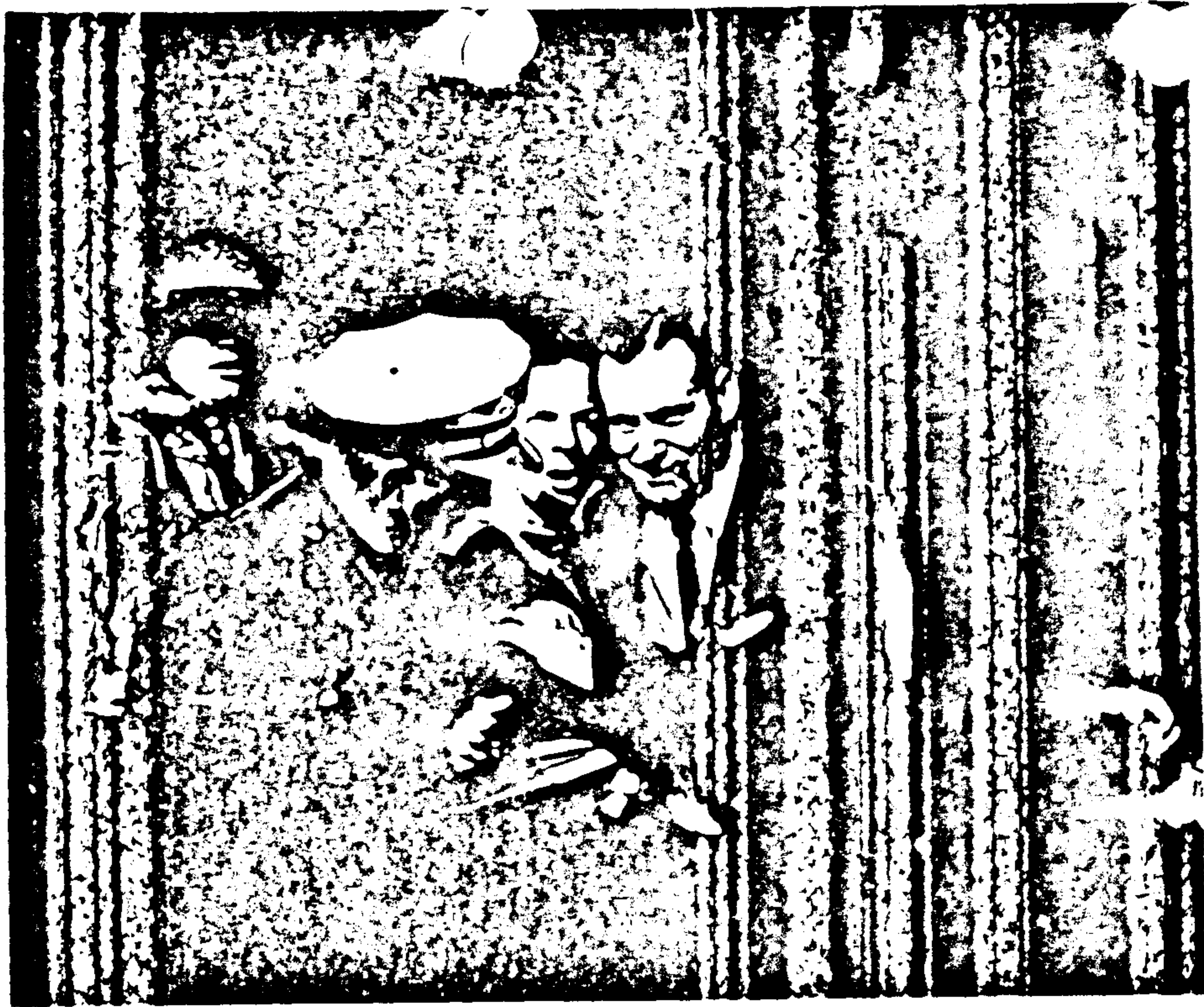
← OSWALD IN FRONT OF TEXAS THEATER (HILL EXHIBIT B)