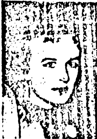
Marina Oswald si reca a deporre di fronte alla commissione d'inchiesta.

La vedova del presunto assassino di Kennedy ha accusato il marito in una dichiarazione alla televisione