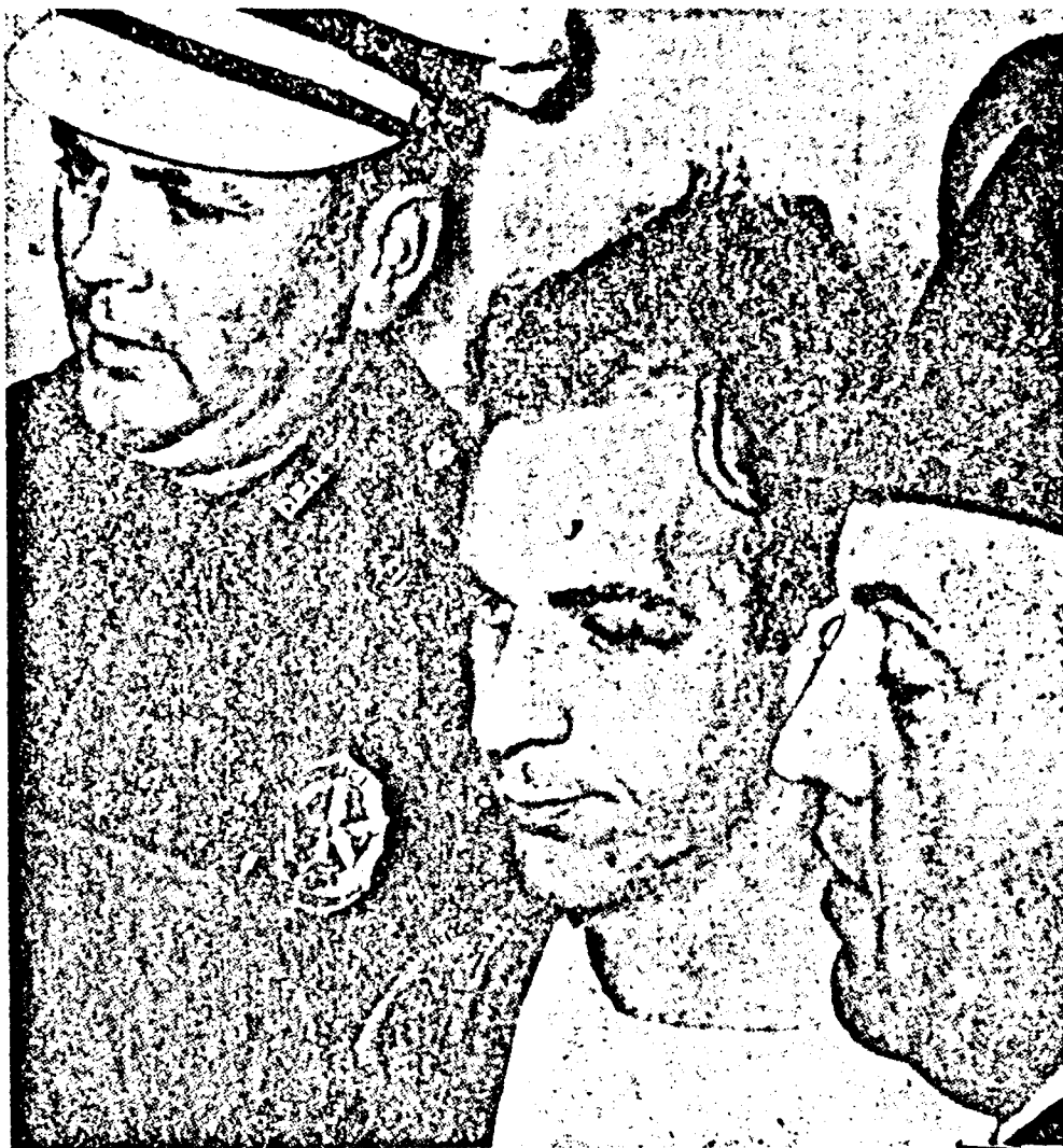
OSWALD IN CUSTODY SHORTLY AFTER ASSASSINATION "We Know You Killed the President," Policemen Told Him