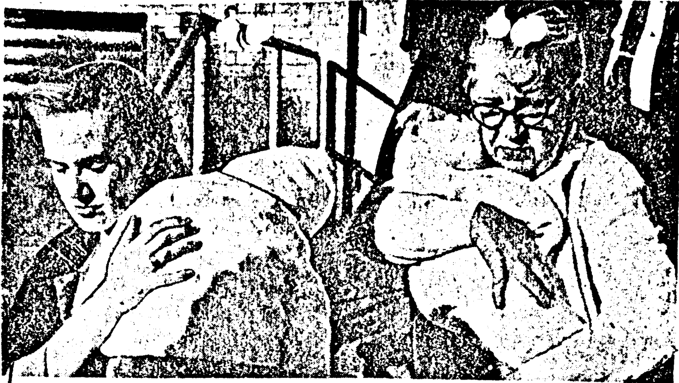
OSWALD'S WIFE AND MOTHER WITH HIS BABIES IN DALLAS When He Came Home on the Day Before Assassination, He Played with the Children