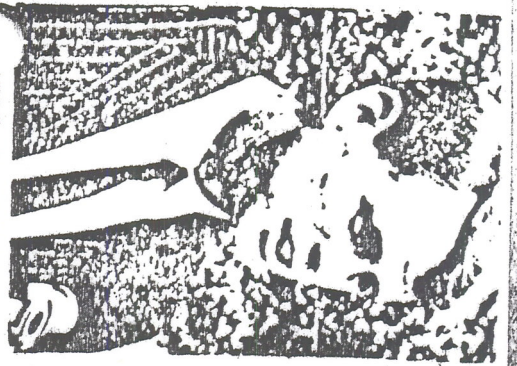
BERT F. KENNEDY ... has a copy of tape but did not take it seriously.

Did Attorney General Robert F. Kennedy help cause the death of his brother, the President of the United States, by not furnishing more F.B.I. Agents and Secret Service personnel to protect the president on the fateful trip to Dallas, Texas after having been furnished the tape taken by the Miami Police Intelligence Department, which stated the assassination of the president was in "the planning"?