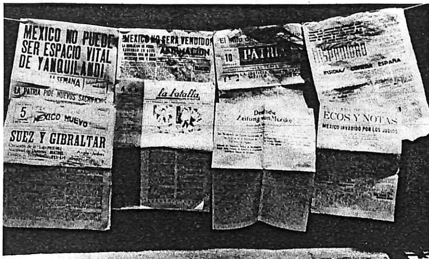
ON NEWSSTANDS in Mexico are many pro-Axis publications. These periodicals have no advertising, make no money, yet circulate widely. They are subsidized by German and Italian agents, and some receive financial support direct from the Axis embassies. "Afirmacion" asserts "Mexico will never be sold to the Yankees." "La Semana," another Axis-inspired newspaper, screams "Mexico will never be the area of expansion for the United States." Others make similar outcries.