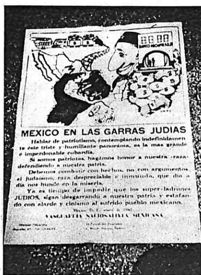
ANTI-JEWISH propaganda of the Vanguardia Nacionalista, Mexican fascist party, depicts Mexico in the clutches of Jewish interests. Such propaganda usually makes the point that the Jews are internationalists, servants of Wall Street.