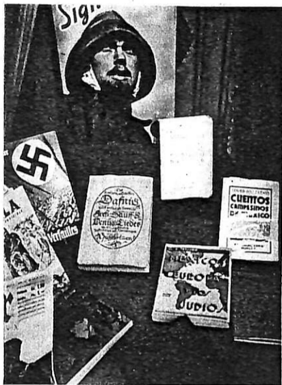
GERMAN BOOK STORES are convenient outlets for Axis propaganda. Displayed prominently in the above book store window is book entitled, "Mexico, Europe and the Jews." In the background is a copy of "Signal," the German illustrated war magazine.