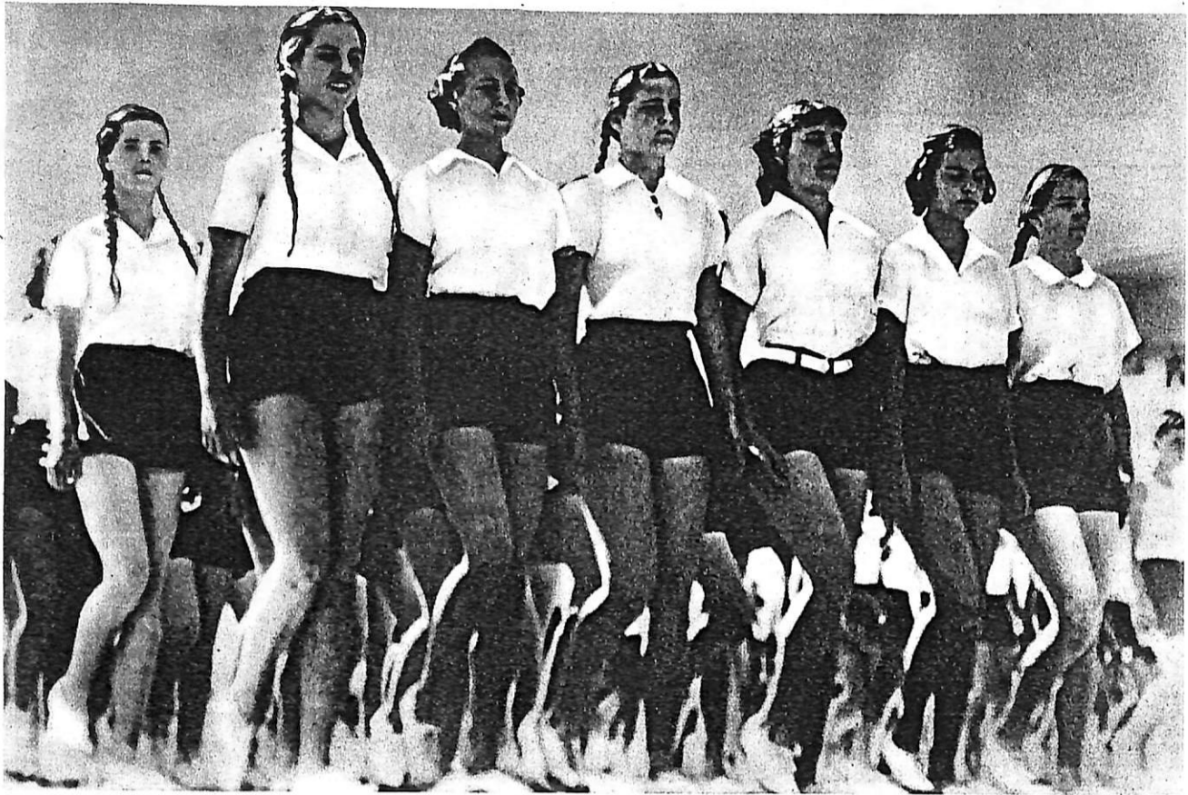
AS IN MOST countries of the Western Hemisphere, there are many Germans in Mexico. They form a clique, go to German schools and model their lives as much after the Nazi fashion as they dare. Above, a group of German-Mexican girls drill in the best Hitler Strength-through-Joy manner. The main threat to Hemisphere unity would, be dispelled if the hold on

German and Italian nationals by their home governments could be broken. As it is, these governments permit their nationals to take out citizenship in foreign lands all the better to serve the Axis' nefarious purposes. This results in discrimination against the truly patriotic naturalized citizens of German and Italian origin who live and work in Mexico and elsewhere.