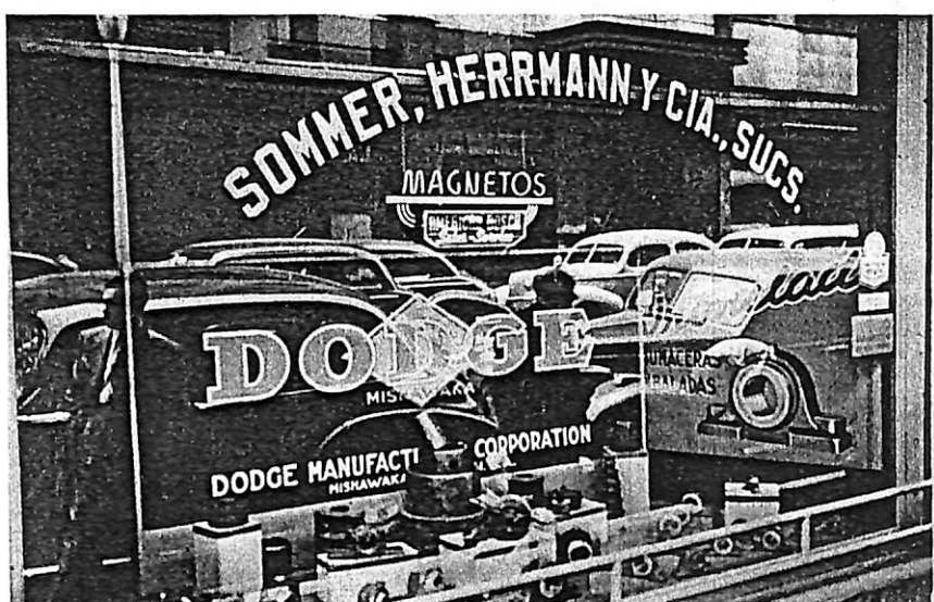
GERMAN COMPANIES, normally distributors for German manufactured goods, are numerous in Mexico. Many of the German owners of these concerns are members of Nazi clubs and support, generally, certain subversive political movements which threaten national unity within Mexico.