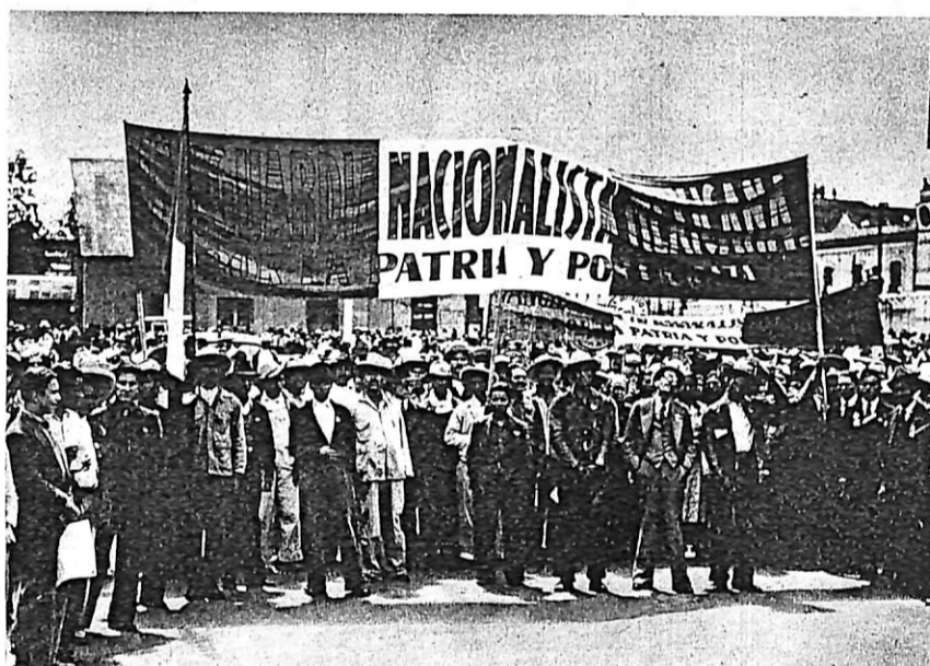
THE VANGUARDIA NACIONALISTA is the homegrown fascist party of Mexico. It regularly holds public demonstrations in which the Jews and the United States are castigated as enemies of Mexican independence. The party is the nucleus of outspoken opposition against the Mexican government's pro-Allied policy. Back of its growth are the same economic maladjustments which caused the rise of National Socialism in the German Reich. Although still lacking in power, it is a definite menace.