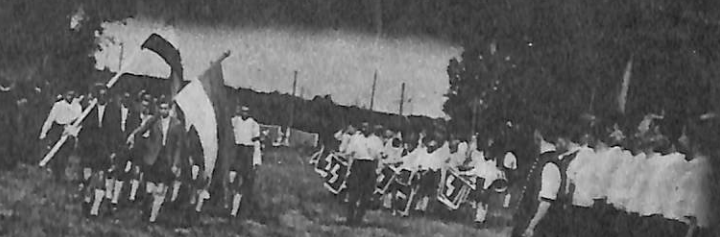
Youth Group Marches