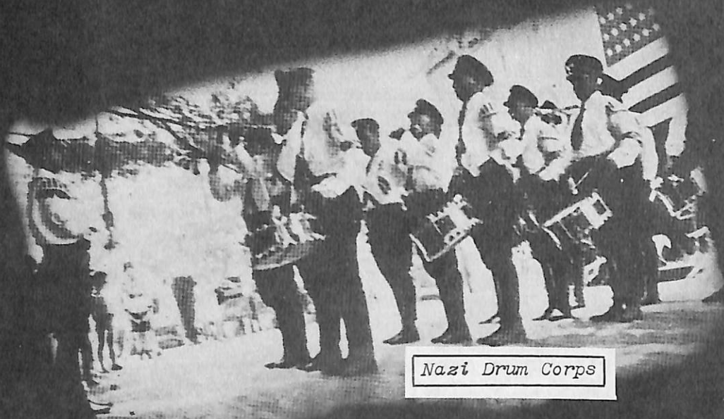
Nazi Drum Corps