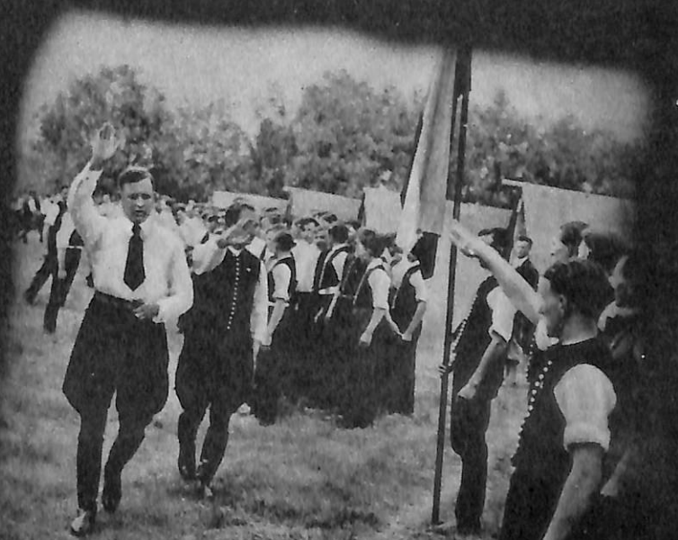
Speakers are greeted in Nazi style