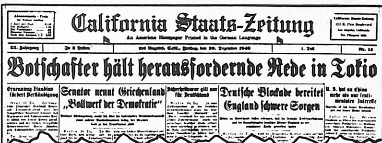
Reproduction of banner-line, appearing in "California Staats-Zeitung" of December 20, last. In verbatim translation, caption reads: "Ambassador Makes Challenging Speech at Tokyo".

this subtly propagandistic phrasing that the caption alludes to the warning speech which United States Ambassador Joseph C. Grew made at the farewell luncheon for Admiral Kichisaburo Nomura, now en route to Washington to assume his post as ambassador to the United States.