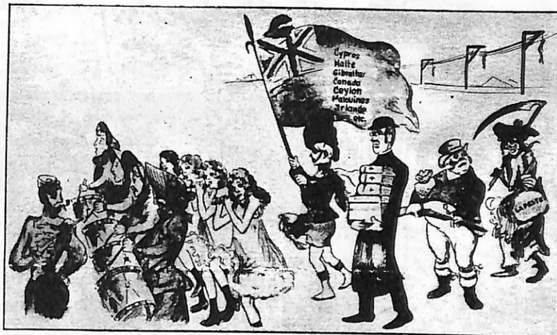
The British are coming — every man for himself! (from the Parisian paper "Crapouillot", November 1931)

own fact that the presiding figure in fields. But they wholly ignore the fact of f - a is slight - h hard in f why man com lish a ke the b con blan "Com lish You man the self then