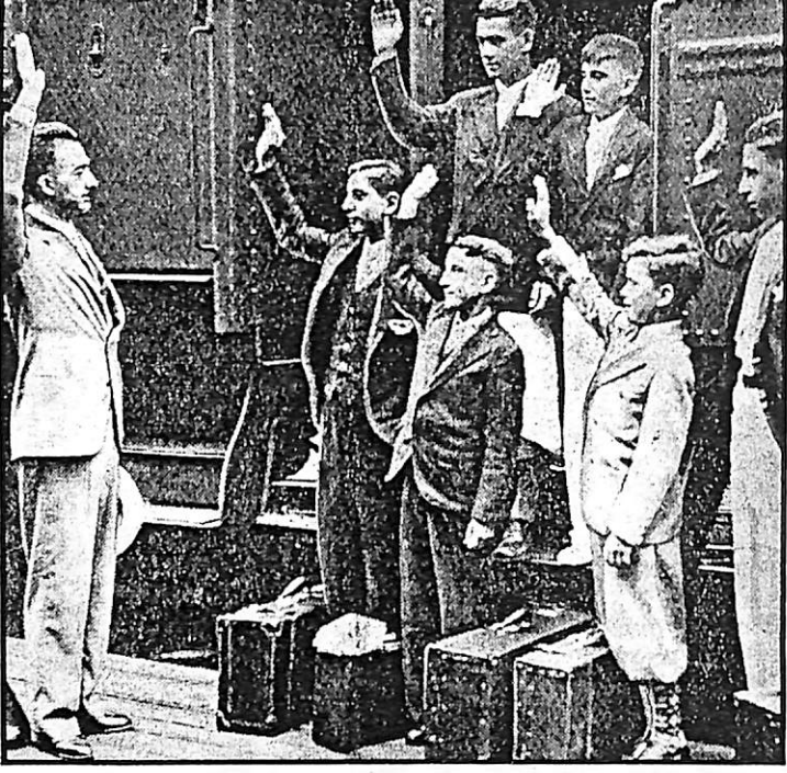
ITALO-AMERICAN SCHOOL CHILDREN give the Fascist salute to Italian Consul Sircana at the Penn station in Pittsburgh as they leave for a free summer vacation in pre-war Italy. There they are taught tactics of Fascist revolution and deliberately trained to destroy democracy in the United States. This overt violation of law by an Italian official points the danger of Fascism to America. END