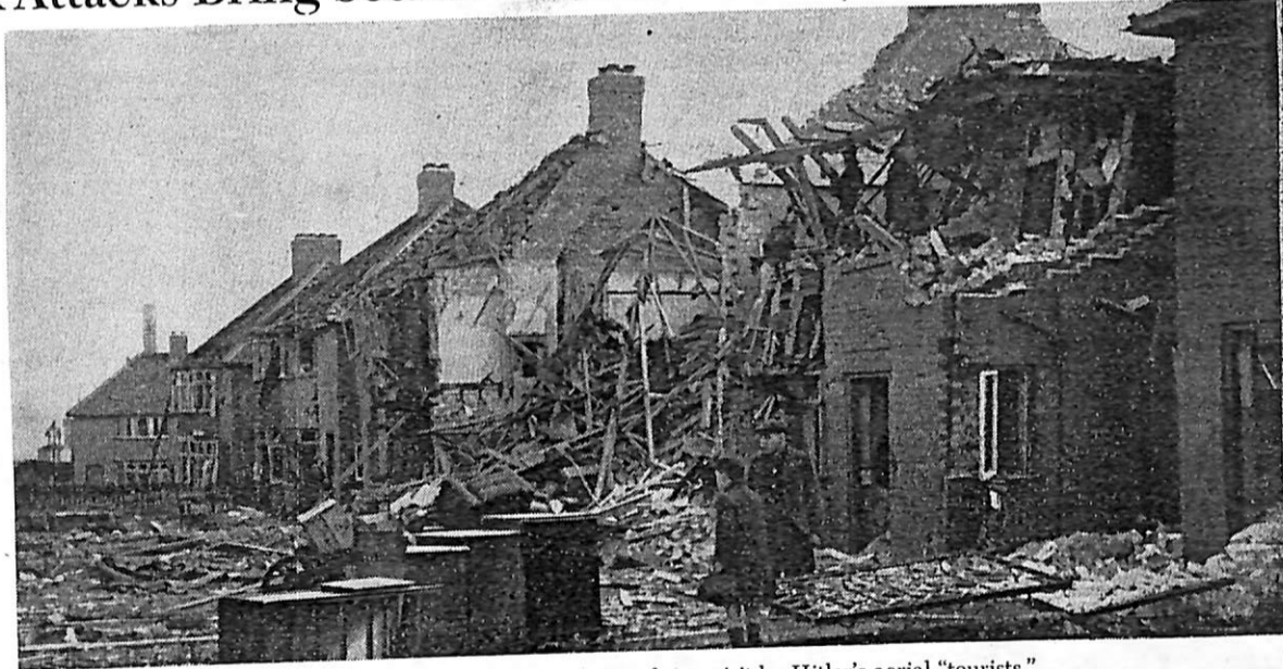
YORK: A whole row of houses goes after a visit by Hitler's aerial "tourists."