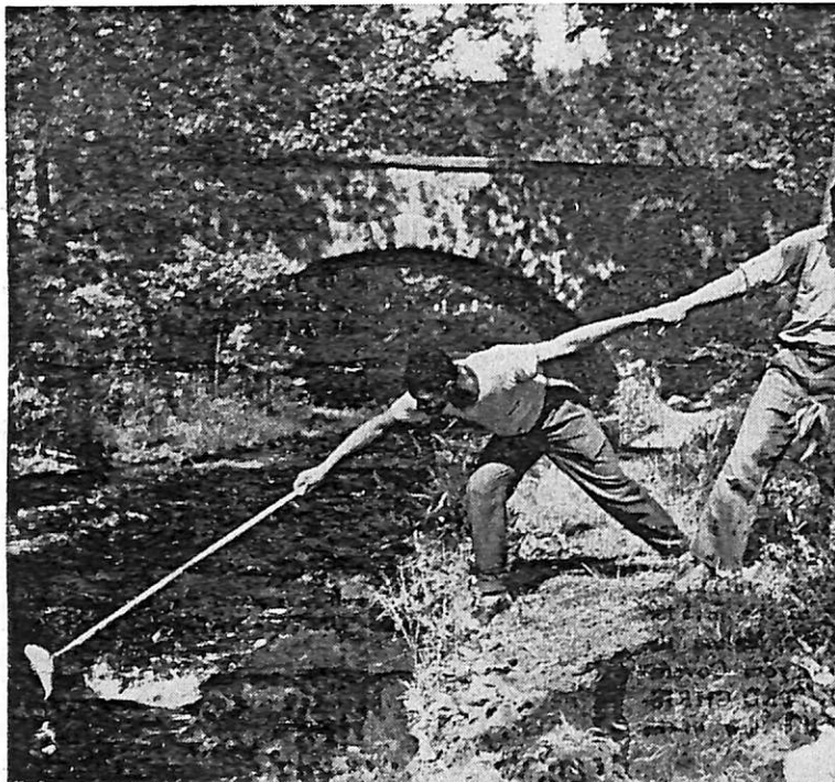
Fisherman's Dream: Spearing a herring in Black Creek on Wiltwyck School grounds. There's a big herring run this month, and the stream's so thick with fish that the boys catch them with their hands.