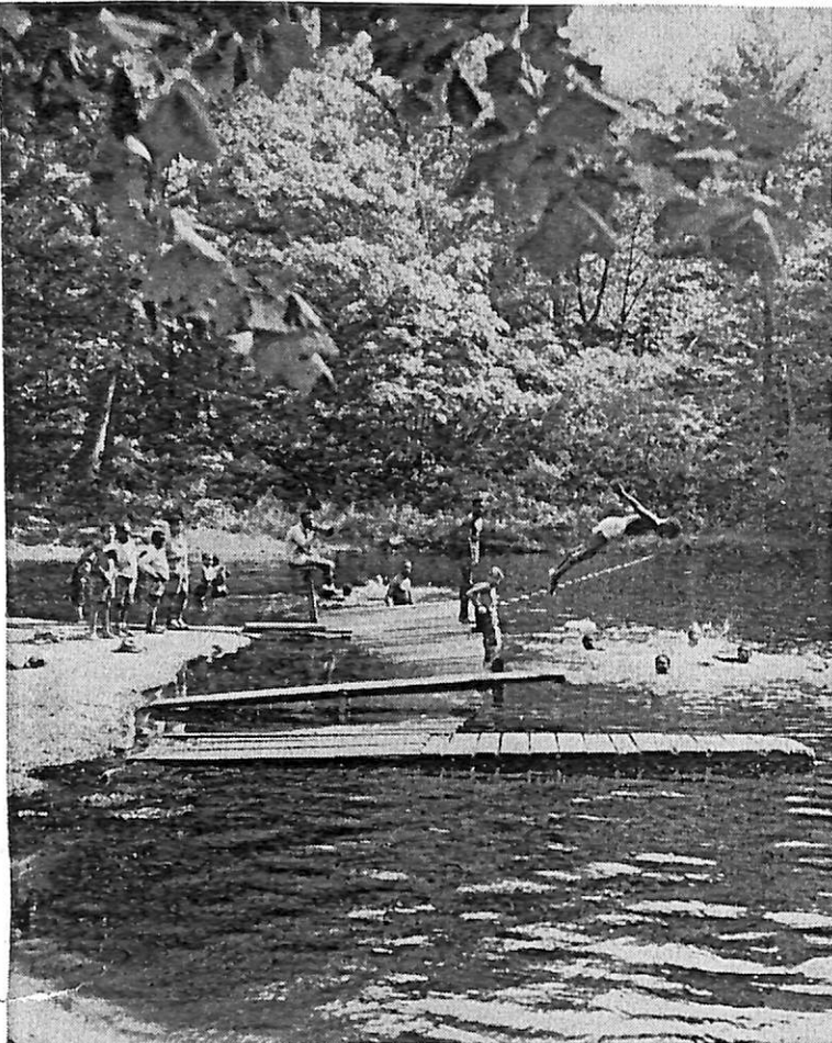
All boys at Wiltwyck are taught swimming and many other sports as part of the rebuilding program. They'll want to show off their prowess in city playgrounds, not streets, when they return.