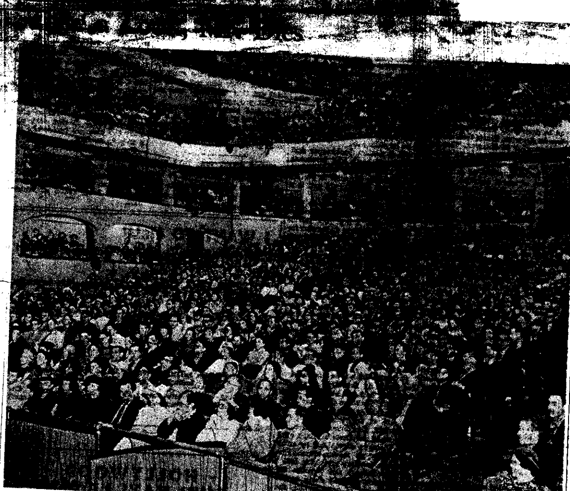
Every seat in the Philharmonic Auditorium was filled Wednesday night as members and friends of the Hollywood Anti-Nazi League turned out en masse to show what they

Although all were deadly serious in their condemnation of the Committee, most of them made fun of its "revelations" and were hoarse from laughing at the audience with their "revelations."