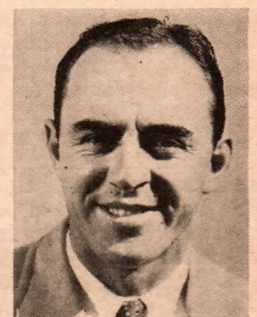
GOLF —Sam Snead—greatest money-winner of golfing pros in 1938. "I've taken Bromo-Seltzer for years," he says.

AUTO RACING —Capt. Eyston held World's Auto Speed Record until 1939—"I find Bromo-Seltzer excellent."