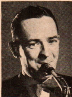
SWING —Jimmy Dorsey, swing's super-saxist, band leader, says: "I appreciate Bromo-Seltzer's fast headache relief."