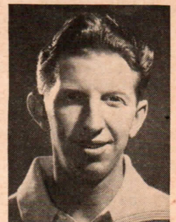
TENNIS —Don Budge, leading tennis ace, won 4 major titles in one year. "I've found Bromo-Seltzer invaluable," he says.