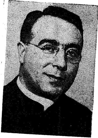
CHARLES E. COUGHLIN